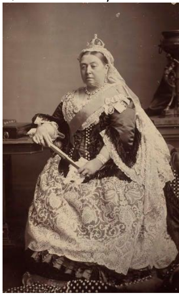
Photograph of Queen Victoria (1882)