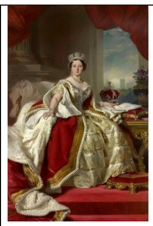
Queen Victoria by Franz Winterhalter (1859)

Gain historical perspective by placing their growing knowledge into different contexts, understanding the connections between local, regional, national and international history; between cultural, economic, military, political, religious and social history; and between short- and long-term timescales.