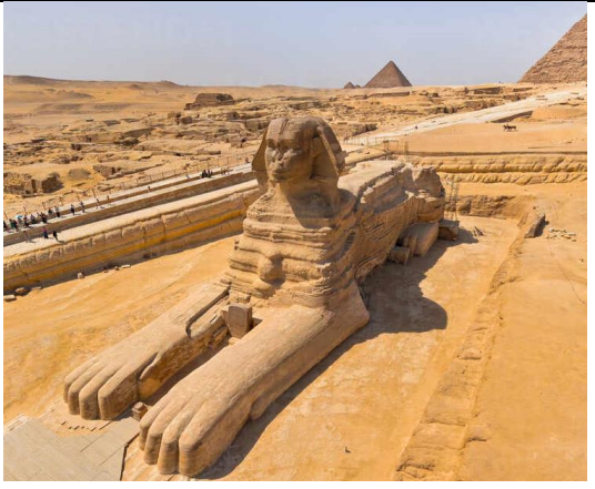
Trade and Travel

Know that Ancient Egypt was one of the wealthiest civilisations at the time.