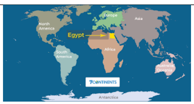
Egypt; The Shang Dynasty of Ancient China

Know where the River Nile is located in Egypt.